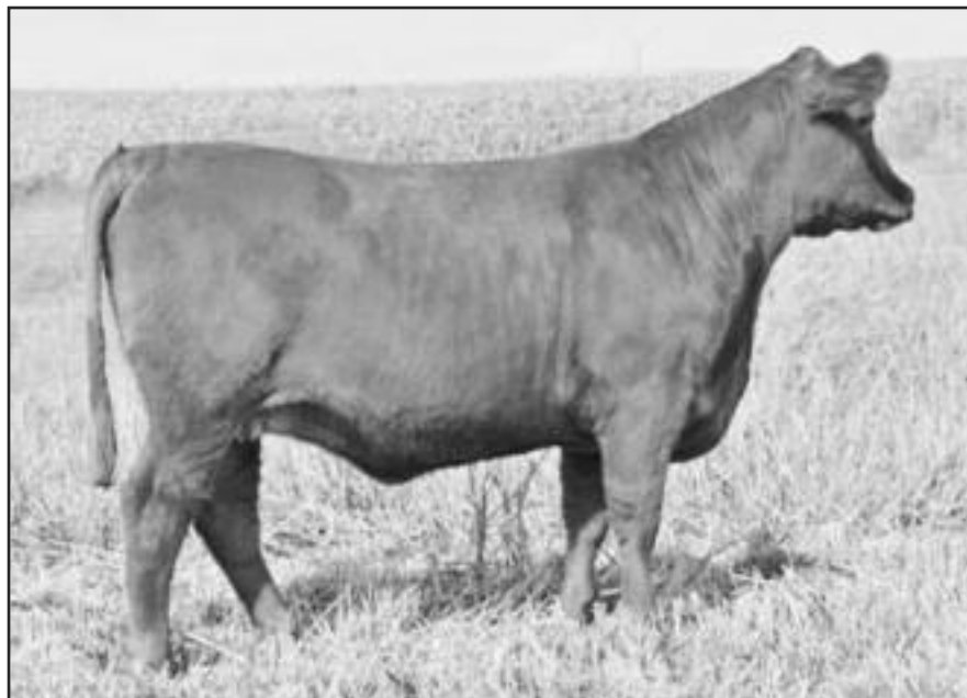
ANDRAS VERNICE 0039 • LOT 33