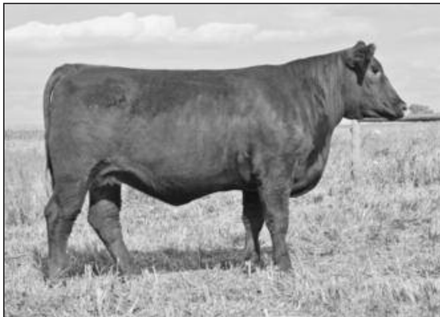
ANDRAS ALBANY 0025 • LOT 13