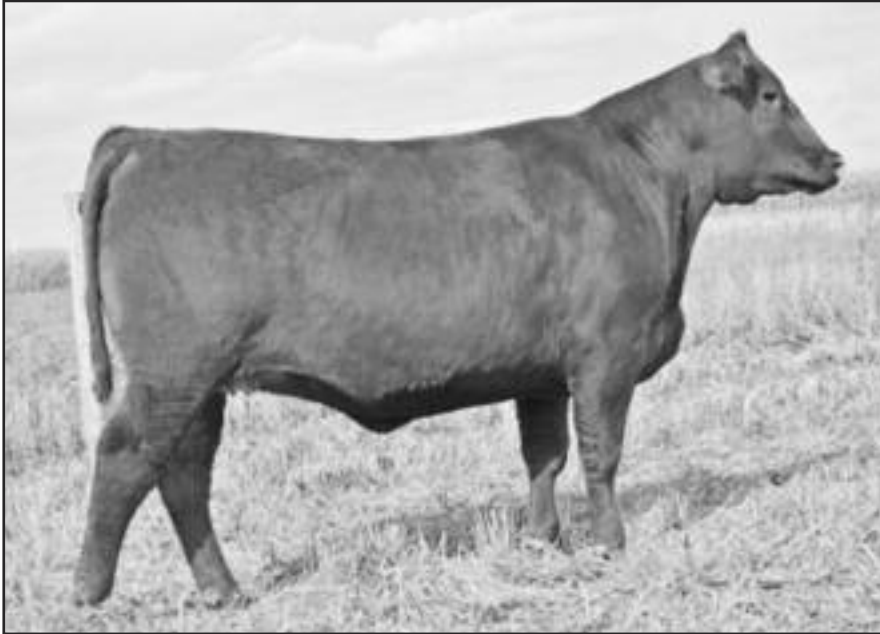
ANDRAS RED DUST 9589 • LOT 15