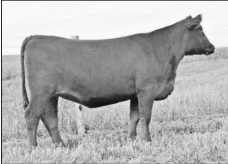
ANDRAS MS MILKY WAY X52 • LOT 30