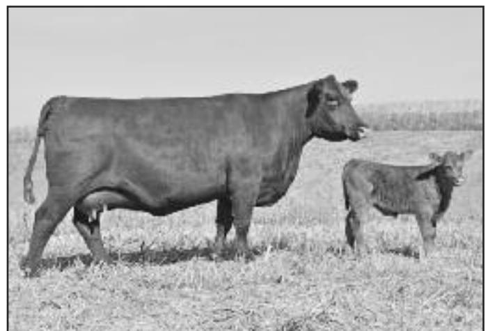
ANDRAS TESS 4033 • LOT 4