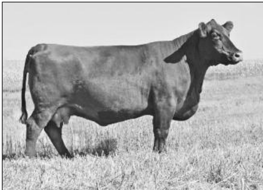
HUST MS ELENAOR R444 • LOT 6