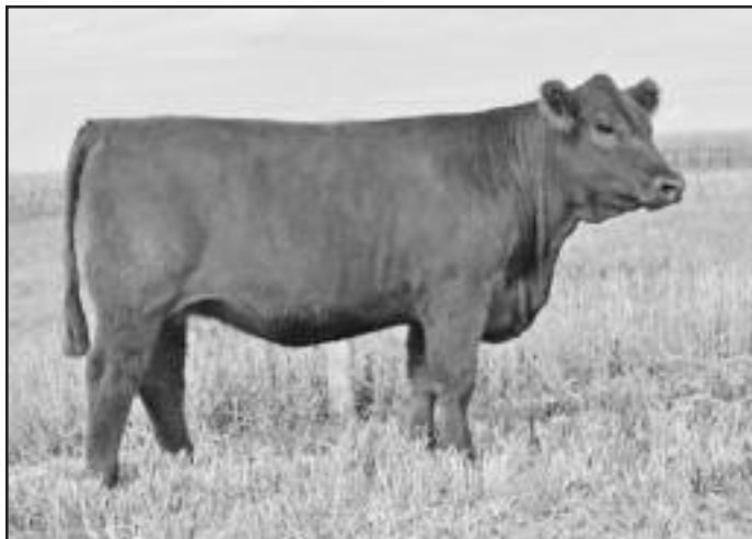
ANDRAS MS EASY 0137 • LOT 38