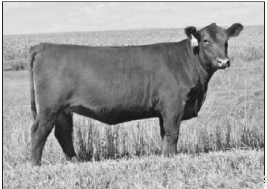
ANDRAS MOTLY 0005 • LOT 22