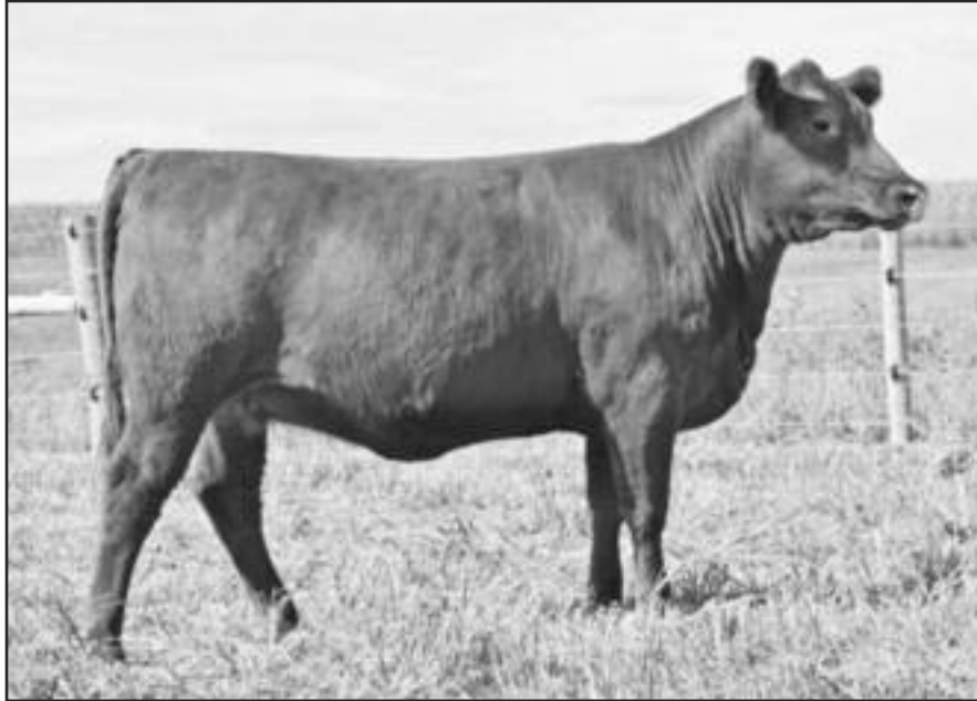
ANDRAS ROSE 0049 • LOT 19