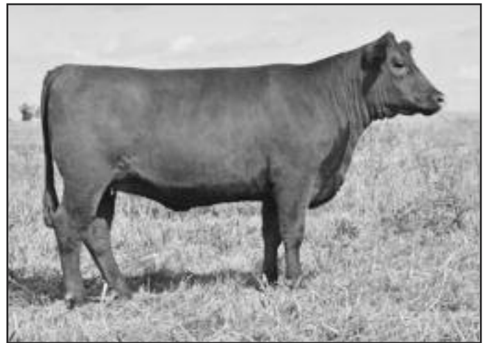
ANDRAS AMBER 9137 • LOT 35

FIRST BLOOD STF CASHMAKER A280 LEACHMAN CURNT VALUE CYN MISS AMBER B806