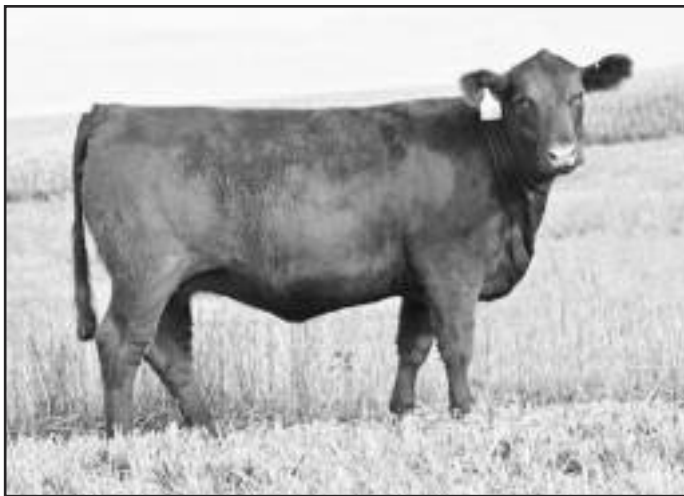
ANDRAS SCARLET 0139 • LOT 36