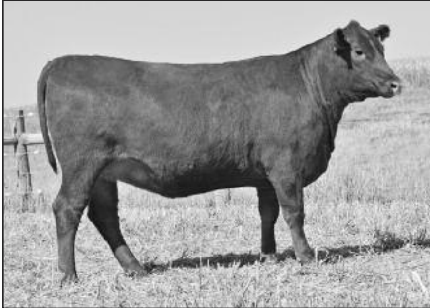
ANDRAS REINA 9185 • LOT 26