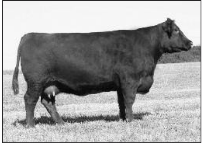
4RC ETTA KG70 • DAM OF LOT 34

BFLO CR VC CHIEF 105 GLACIER REBALAS LMAN LADIES MAN 1144B LCHMN ETTA E1092