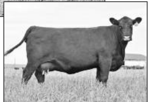
ANDRAS TESS 4033 • LOT 4