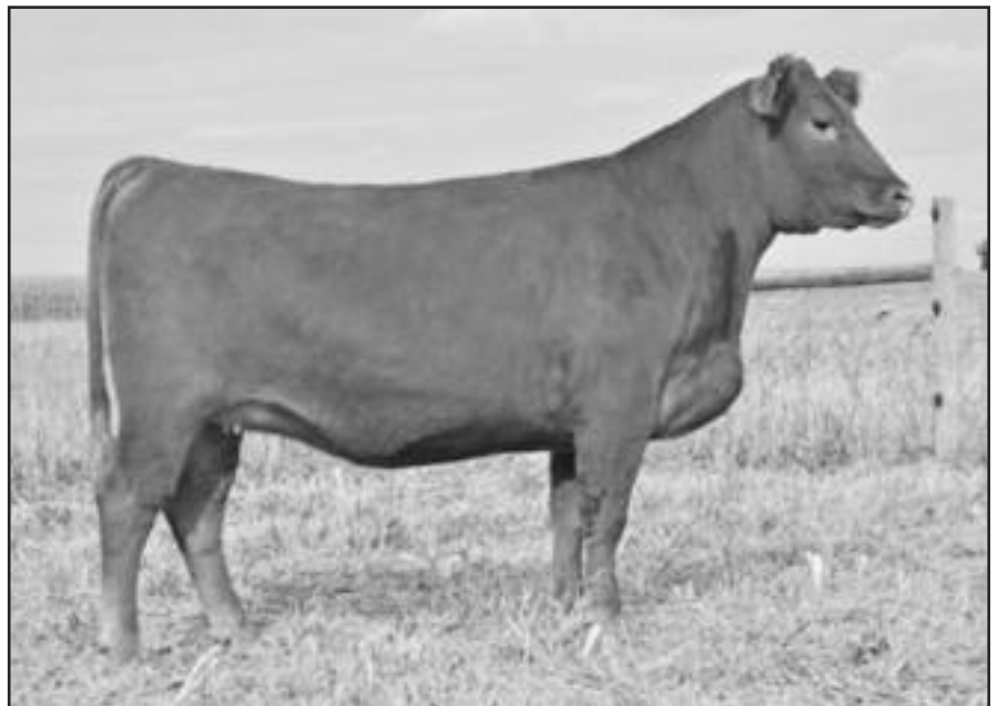
ANDRAS MS CASH 9563 • LOT 16