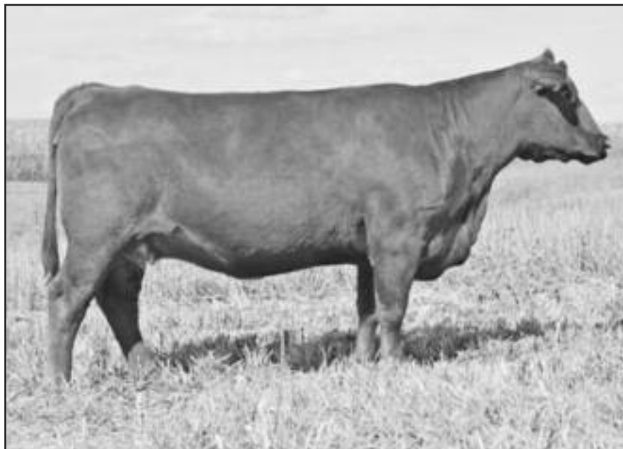
ANDRAS TAYLORS 4029 • LOT 7