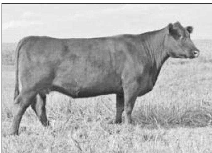
ANDRAS PINETA 5011 • LOT 10