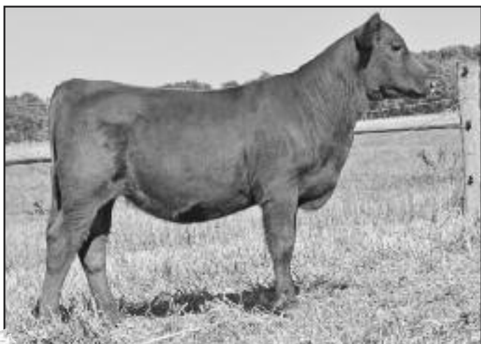
ANDRAS PAIGE 1131 • LOT 3