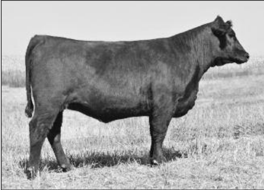
ANDRAS PINETA 9181 • LOT 21