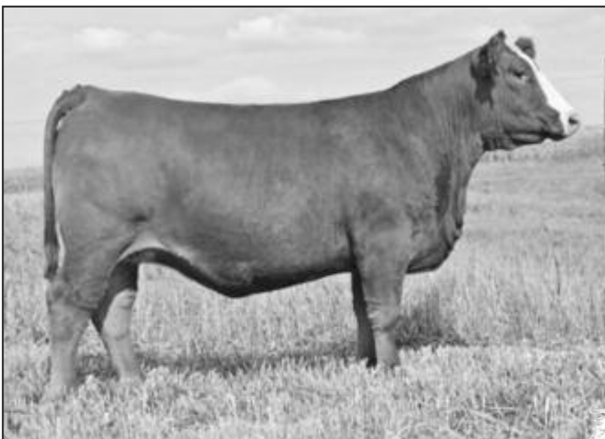
ANDRAS MS RED BLAZE 9195 • LOT 18