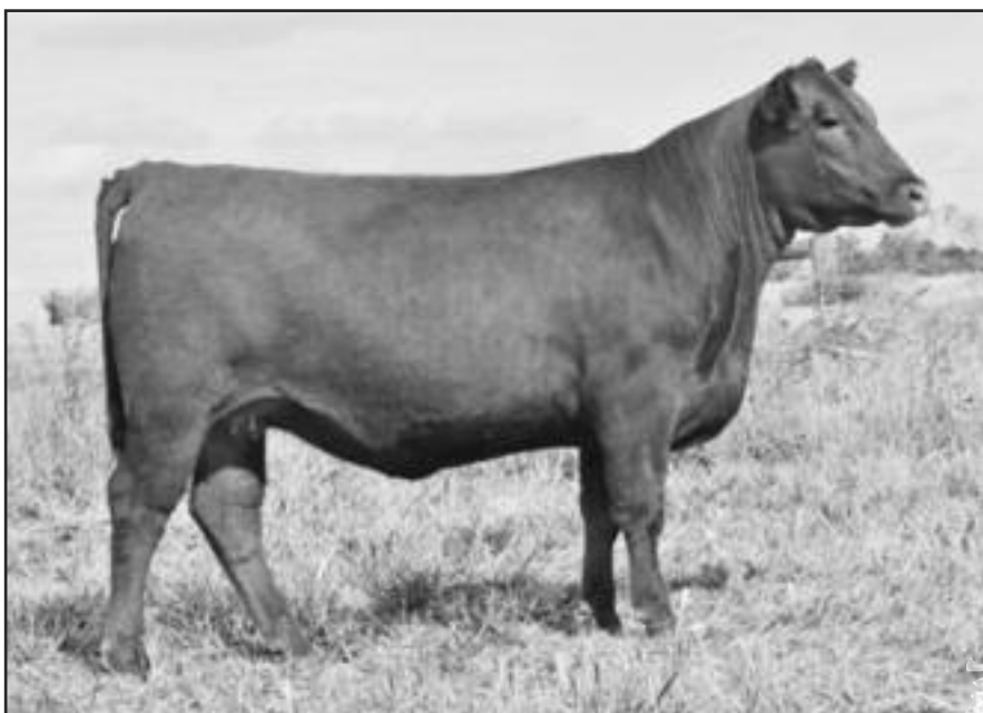
ANDRAS JEWEL 0013 • LOT 14