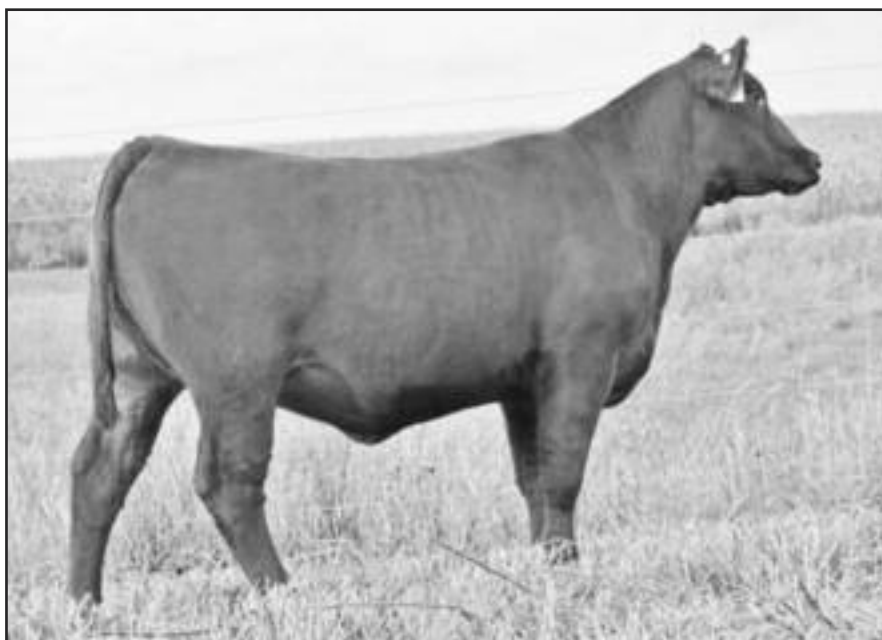
ANDRAS DIVA X14 • LOT 24