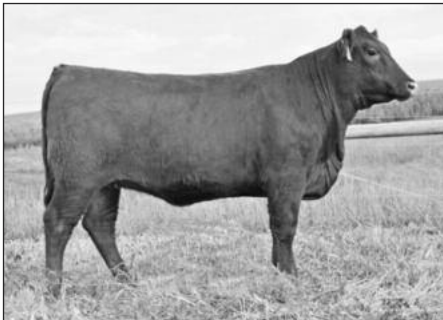
ANDRAS LADY 0017 • LOT 23