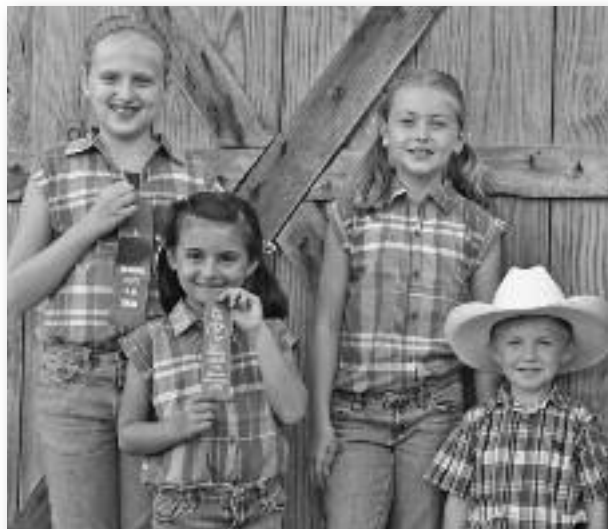
The kids showing off their 1st place ribbon from the Scott County Fair.