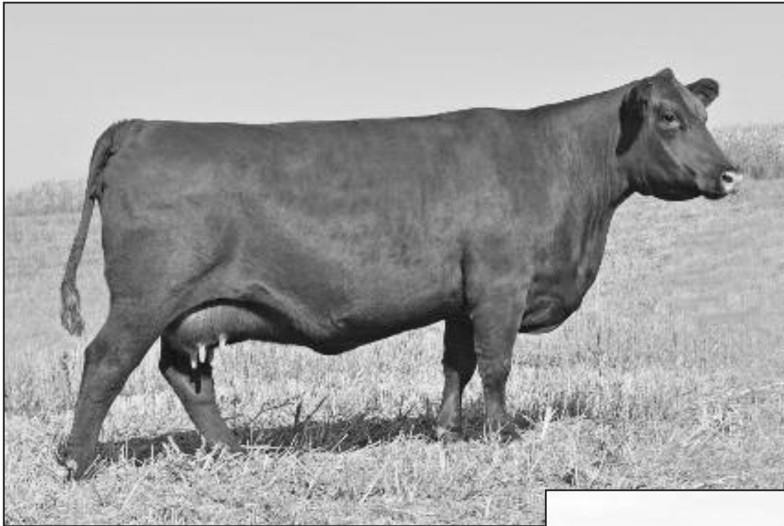
ANDRAS TESS 4033 • LOT 4