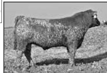
Andras Thunder 9184 • #1368897 BW -0.8; WW 35; YW 66; Milk 18; TM 36 Owned with Pat Evans, IL