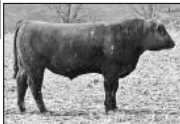
Andras New Day 9180 • #1368914 BW -0.8; WW 36; YW 69; Milk 26; TM 44 Owned with Randy Urish, IL