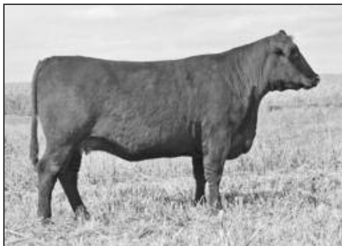
ANDRAS PERI 8073 • LOT 9