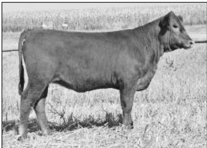
ANDRAS NELL 1039 • LOT 2