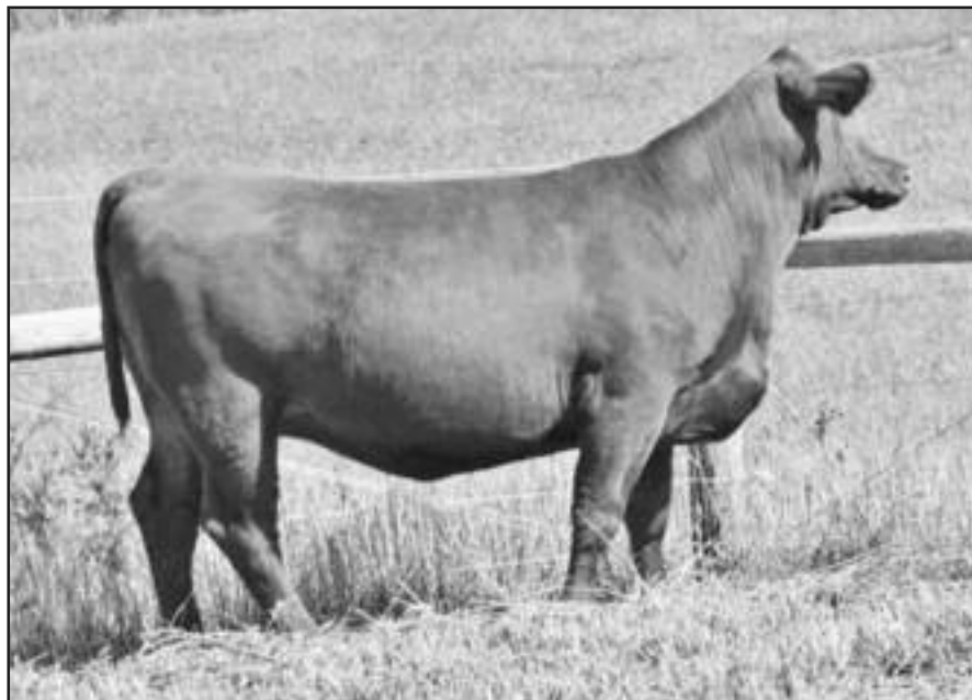
ANDRAS SAGE 9101 • LOT 17