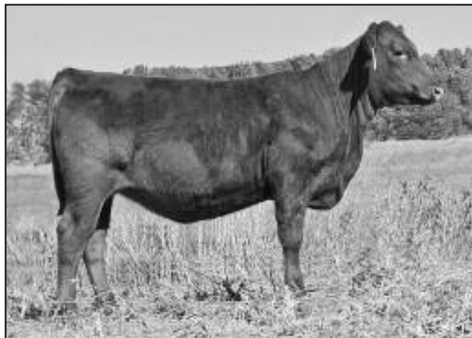
ANDRAS TAMARA 1007 • LOT 1